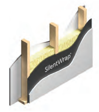
STC 51: wood stud + insulation