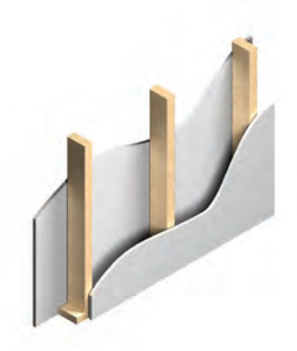
STC 29: wood stud