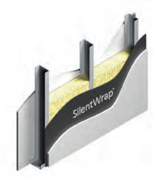
STC 53: steel stud + insulation + SilentWrap

For more information, please visit us at: www.SoundAcousticSolutions.com Toll Free: (877) 399-9697 | Email: info@SoundAcousticSolutions.com