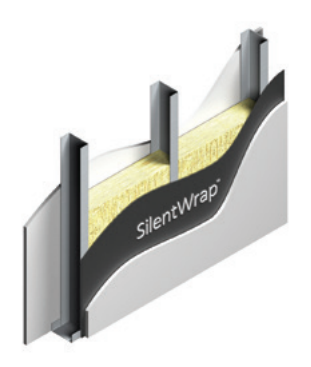
STC 53: steel stud