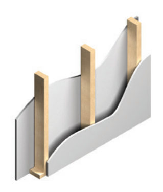
STC 29: wood stud